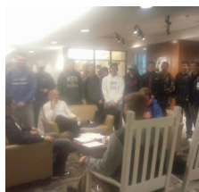
Open on the snowday!