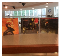
Collection spotlight: #bowie