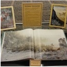
Featured Display: National Geographic