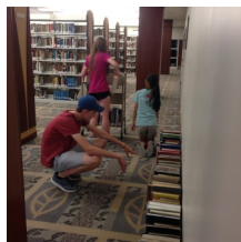
Changes on the Second Floor