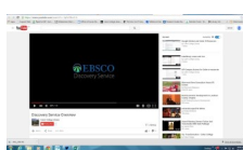
Did You Know?